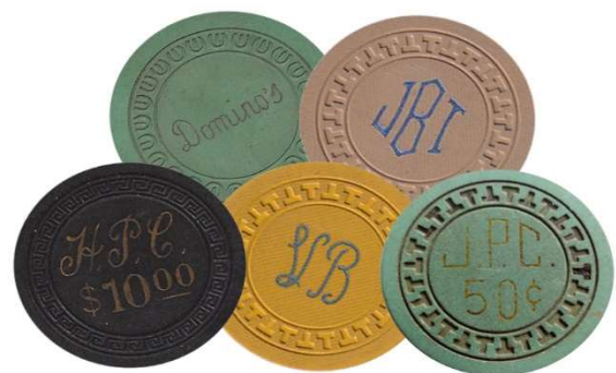
Examples of area chips:

Now cornered from doing any more damage, Irene bolted from the tavern and ran across the street to the Yoder's Tavern where she knew more machines were housed. As she approached the door, a quick thinking bartender lunged forward and just managed to snap the lock. Irene pounded on the glass, screaming, but stopped short of pulling out her ax. She knew that damaging more than the illegal gambling machines would get her in trouble.